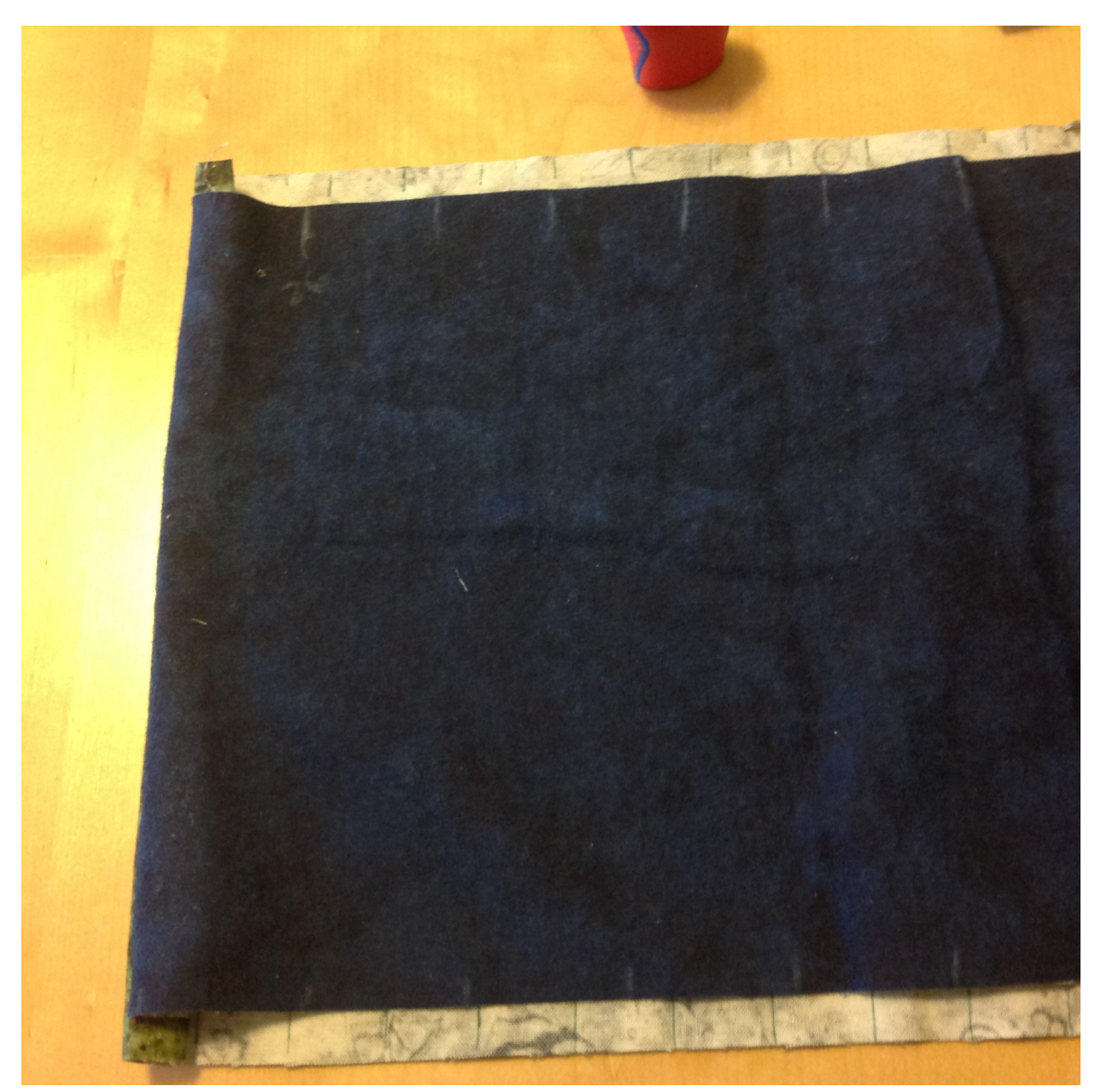
(Place a straight pin to give yourself a guide for stitching). Channels will begin to form.