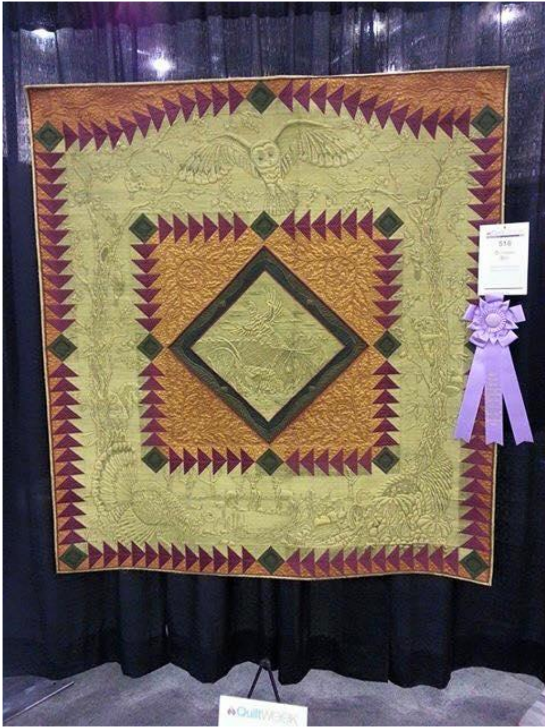
Poppy Promenade won second place in the Freehand Machine Quilting category at Northwest Quilting Expo in Portland!