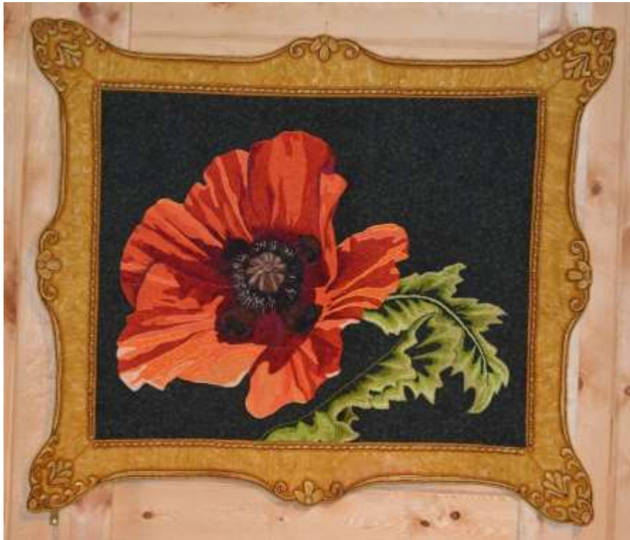
2. Show and Share April